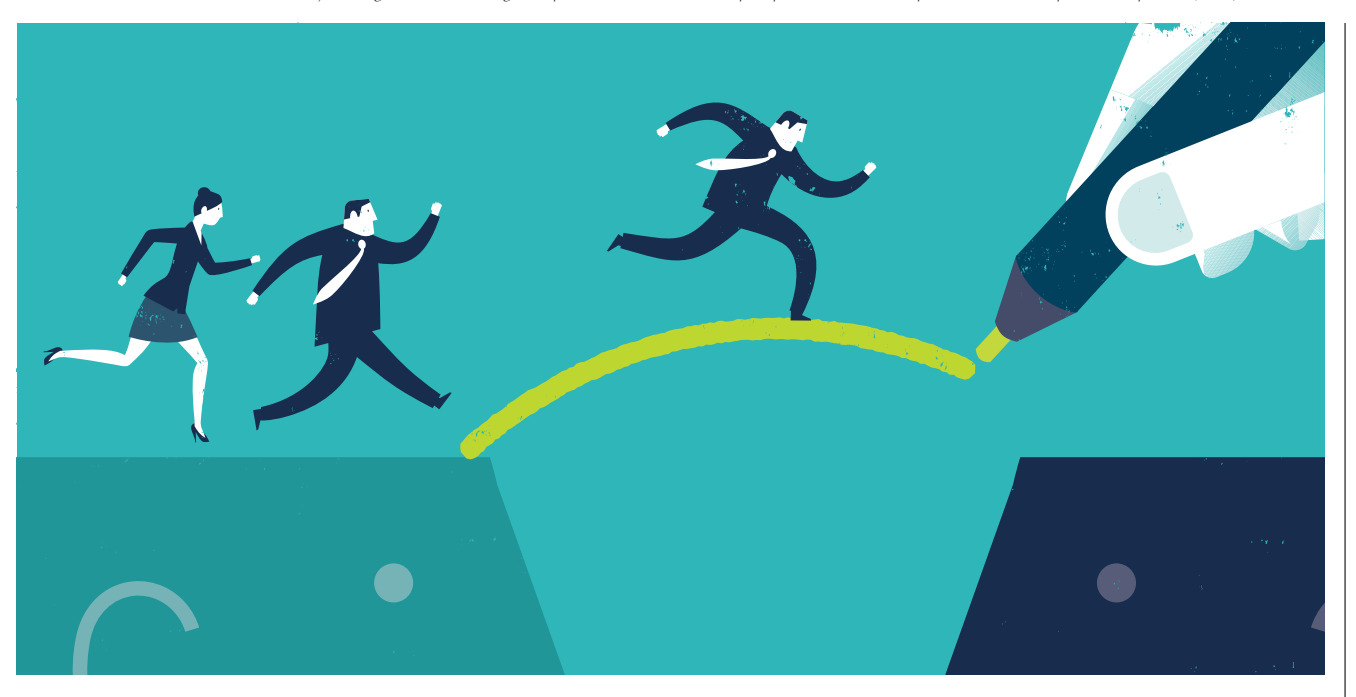
Accessibility inside government buildings and facilities: the contributions of the public works audits of the Federal Court of Accounts of Brazil (TCU) // Articles

sibility evaluation in new buildings as part of the annual cycle of audits of public works (Fiscobras), from 2012 to 2014. We also present examples of theme audits in public housing programs (Minha Casa Minha Vida), education programs (Proinfância) and primary healthcare units (UBS) and emergency care units (UPA). Despite the legal deadline to turn all federal buildings and facilities into fully accessible buildings being long overdue - more than eight years now -, the results of the study indicate that there are still many challenges to overcome. To begin with, there is no specific budget allocation in the Federal Budget to increase transparency regarding the actions carried out and allows for the proper monitoring of investments regarding accessibility. In addition, our federal public servants are not trained to deal with accessibility. We understand that the Federal Government is far from achieving the minimum accessibility requirements demanded to comply with good technical standards. On the other hand, there is the contribution of TCU audits that encourage ethical behavior, especially for making this issue a priority. The ongoing demand also leads to reflection and innovation, seeking effective solutions concerning accessibility.